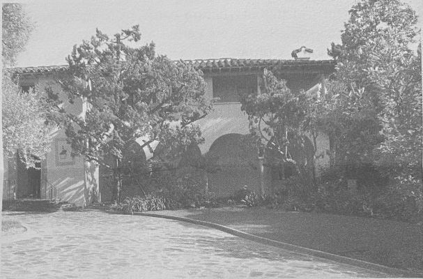
The First Showcase House