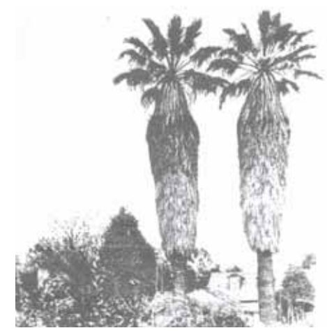
Historic "Twin Palms", moved from the Palm Springs area to Wilson Ranch 100+ years ago. Still located at the rear of the 1541 Cambridge Road home.